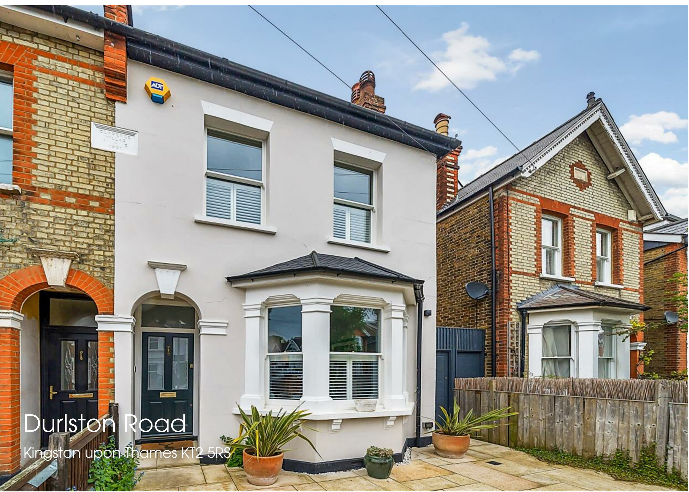
Durlston Road Kingston upon Thames KT2 5RS